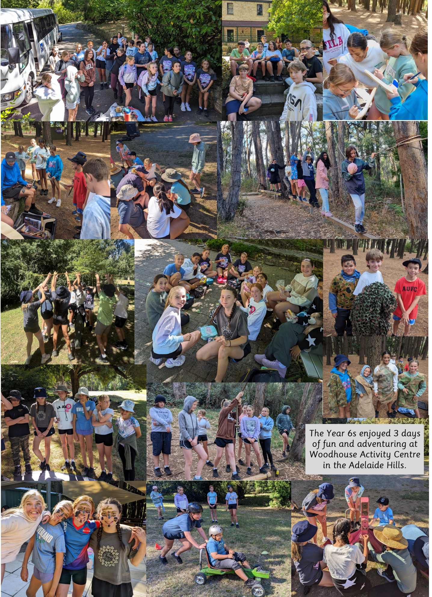
The Year 6s enjoyed 3 days of fun and adventuring at Woodhouse Activity Centre in the Adelaide Hills.