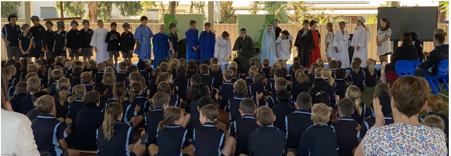
The whole school attended the Easter Play portrayed by our Year 5 students.

The staff and I have been reflecting on our Annual Improvement Plan – 1) Staff Faith Formation, 2) Aboriginal and Torres Strait Islander Education, 3) Mathematics, and 4) Student Agency. There are already indicators showing evidence of our growth and development.